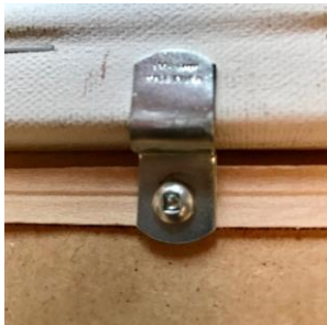
Offset canvas clip placement

Example: D-ring placement, wiring, offset canvas clips, staples on back, no gaps between canvas & frame.