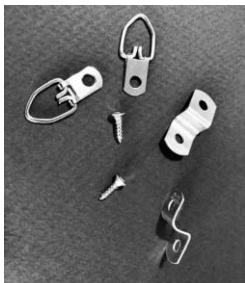
D-rings and offset canvas clips